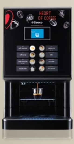
Phedra Evo Espresso

Water supply or internal tank or independent tank