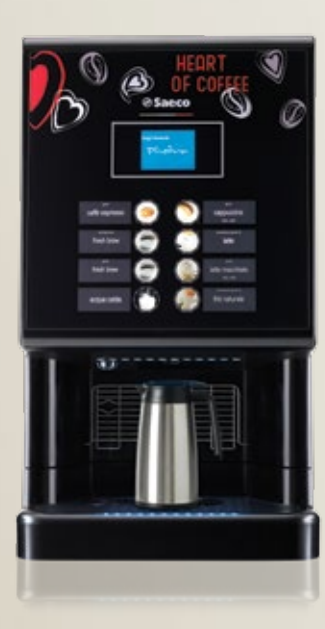
Phedra Evo TTT

Water supply or internal tank or independent tank