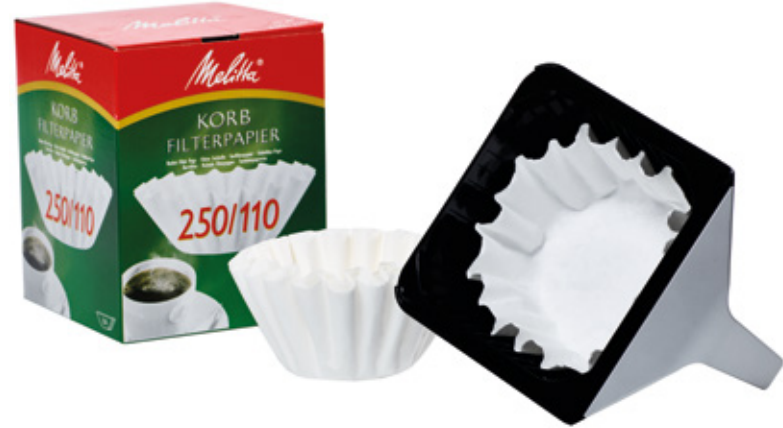
PERFECT COFFEE QUALITY

Thanks to the classic filter system with Melitta® filter paper and pyramid filter or basket filter. Guaranteeing the best development of aroma, even for small quantities.